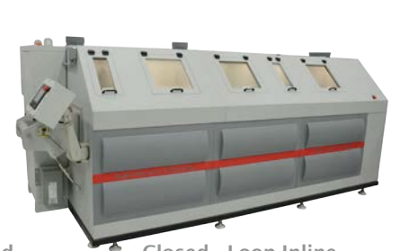
Aqueous Cleaner with Isolation