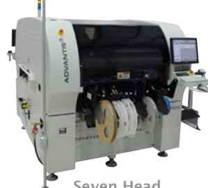
High Speed SMT 15.300 CPH Placement